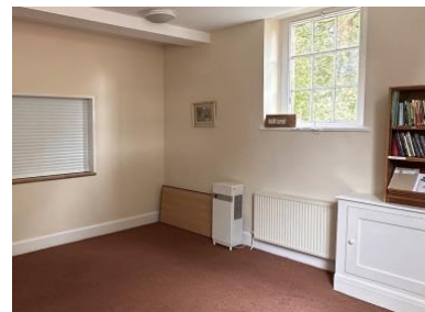
Small Meeting Room

General users £24.00 Voluntary groups £20.00