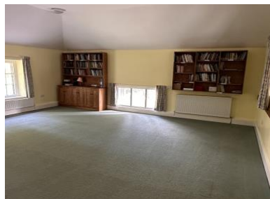
Wyn's Room (upstairs)

General users £32.00 Voluntary groups £26.00